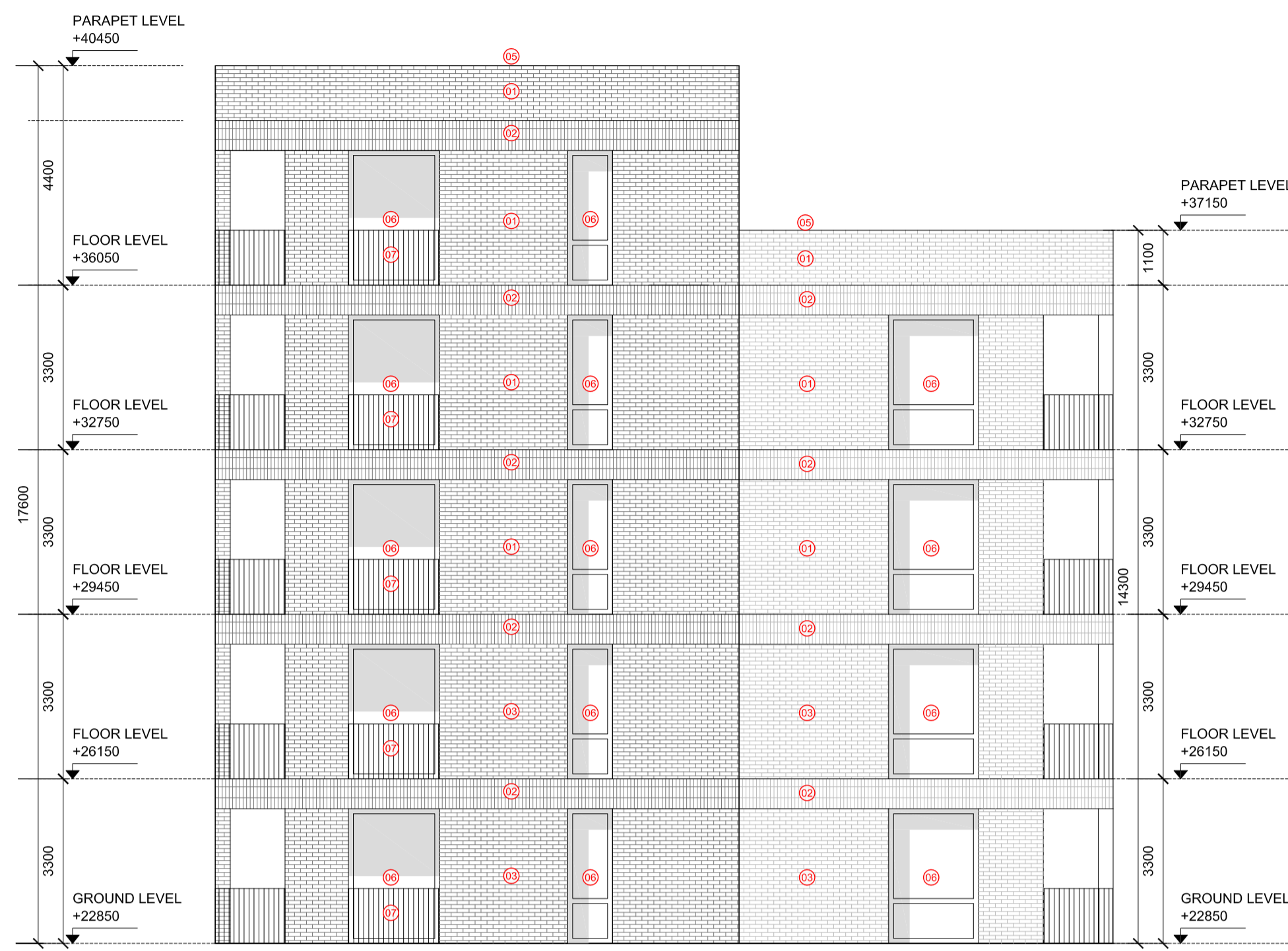
01 Western Elevation - BUILDING D 1:100 @A1