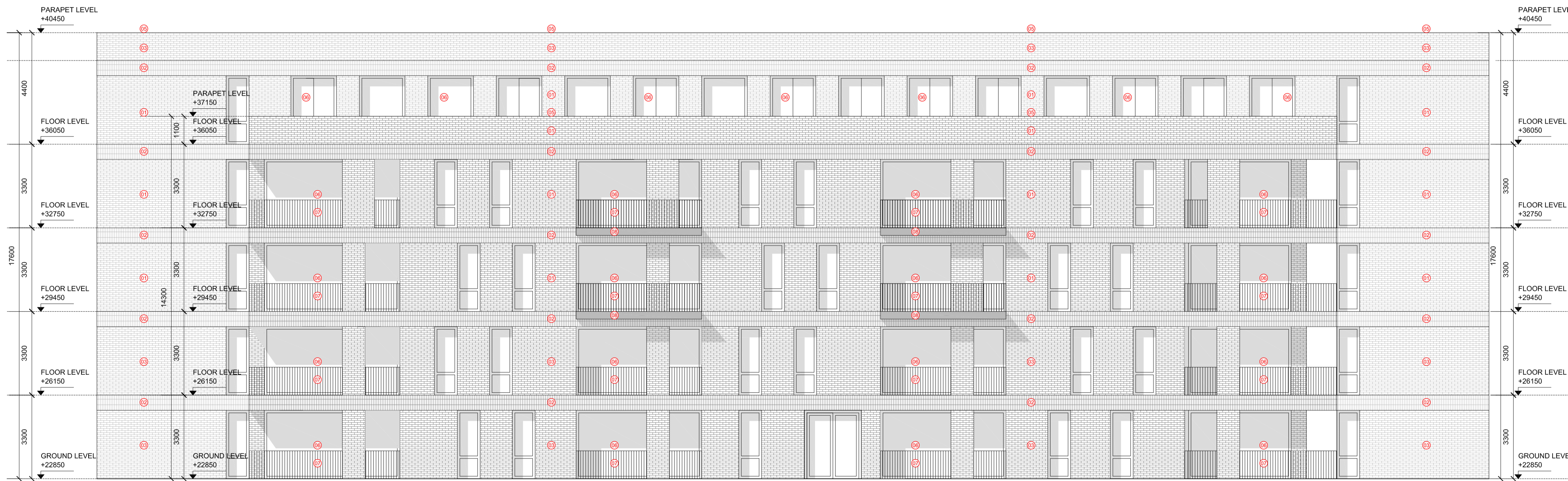
03 Southern Elevation - BUILDING D 1:100 @A1

DO NOT SCALE FROM THIS DRAWING. WORK ONLY FROM FIGURED DIMENSIONS. ALL ERRORS AND OMISSIONS TO BE REPORTED TO THE ARCHITECT. THIS DRAWING TO BE READ IN CONJUNCTION WITH RELEVANT CONSULTANT'S DRAWINGS.