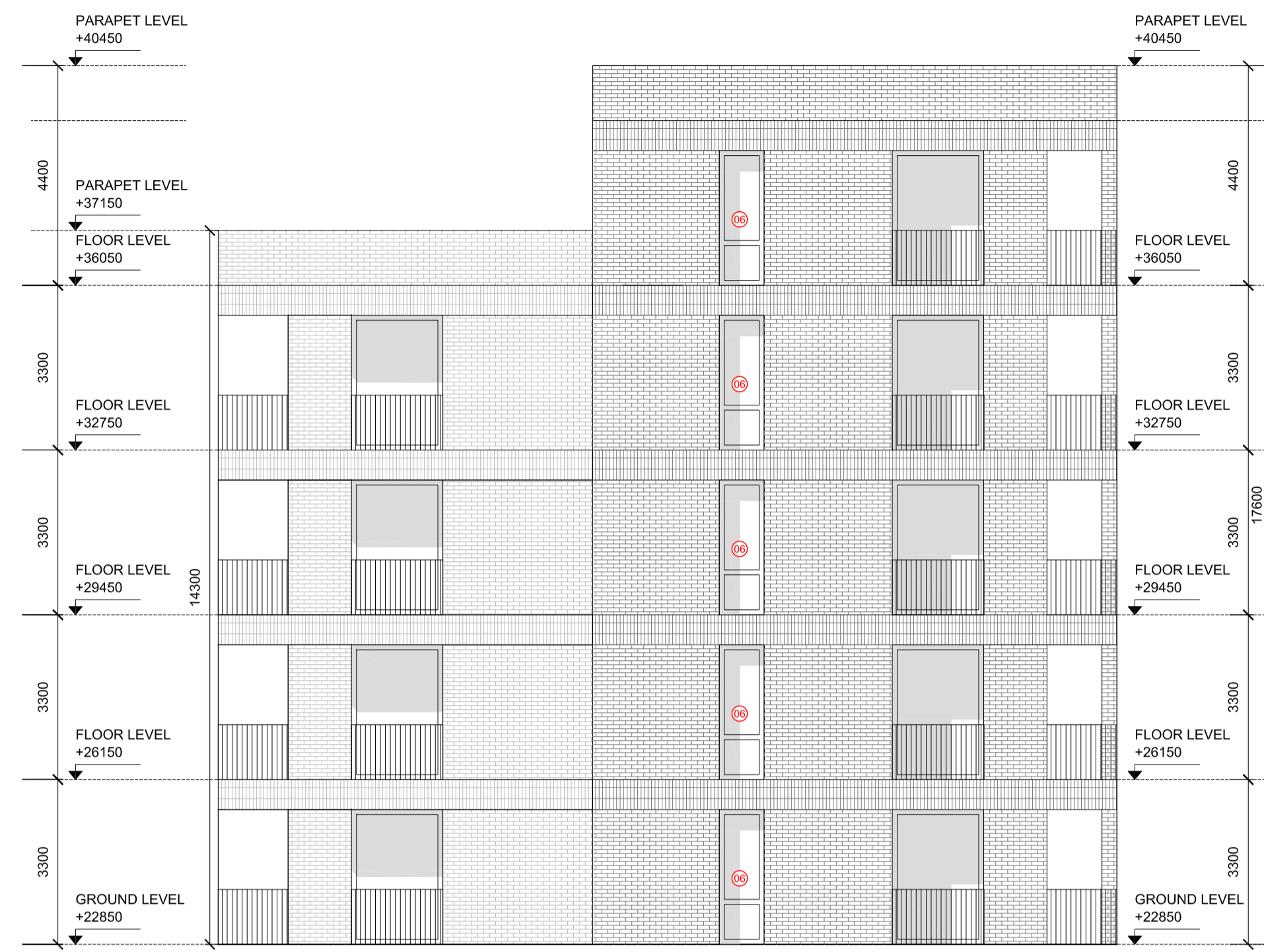
02 Eastern Elevation - BUILDING D 1:100 @A1